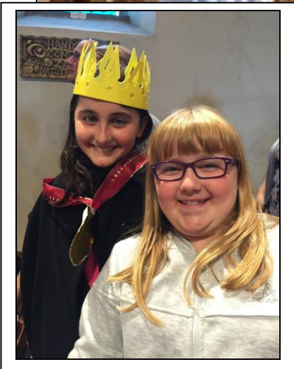
A special service marked the Queen's 90 th birthday – a book about the Queen and her faith was given out.